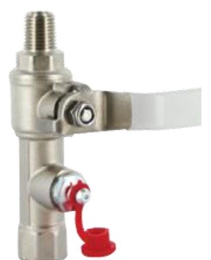
Art. No. 113972 Purge connection with manual valve R 1/4 male x G 1/4 female (brass nickel plated)