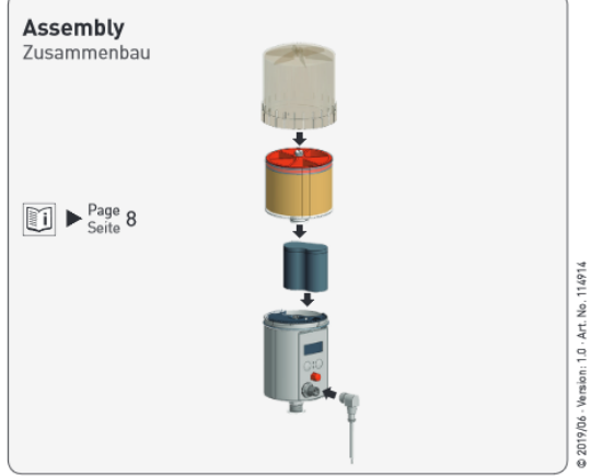
perma-tec GmbH & Co. KG | www.perma-tec.com | S1